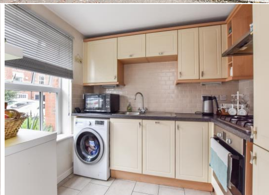
Three Bedrooms Ground Floor Cloaks / WC