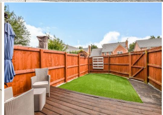
Low Maintenance Gardens Garage & Parking At Rear

Ashford Drive Appleton, Warrington, WA4 5GG