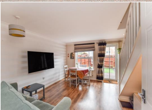
Modern Mid Mews Property Popular Development