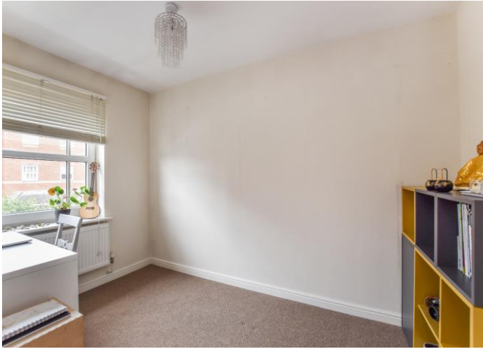
Bedroom Three 9' 5" x 6' 9" (2.87m x 2.06m)